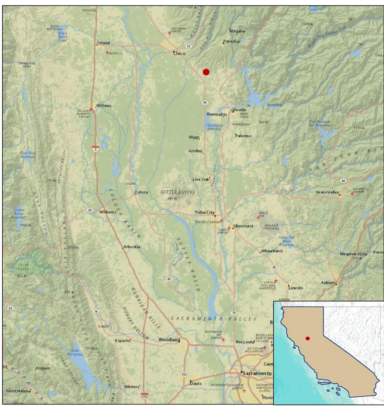
Figure 1. TPP Clear Creek Ecosystem Restoration project location.

area may have on water quality in Clear Creek. Additionally, availability of groundwater during the dry season to support woody vegetation is unknown. Risks for this study will be tracked using a Risk Register.